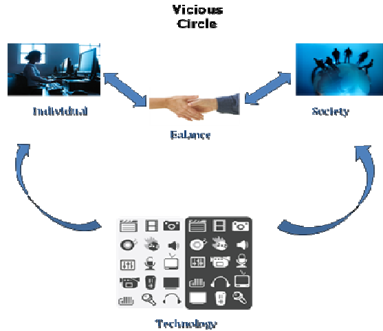
Figure 1. The constant development of data collection, aggregation and processing technologies results in a vicious circle as society attempts to seek a balance of protection between the individual's privacy and security of society.

As technology advances, new ways of gathering private information emerge, and this affects the ways in which privacy may be protected and violated. Technological developments always proceed faster than the establishment of legislation and regulatory policies, thus fuelling the vicious circle. Thus, society is continuously attempting to achieve a balance between privacy and security. Consider the war against illegal drugs in the US: It was thought that using heat sensors to find marijuana growing operations would be acceptable, but in 2001 [Kyllo v United States (533 U.S. 27)] it was ruled that using thermal imaging devices that can reveal previously unknown information without a warrant does indeed constitute a violation of privacy. Our research, and the EnCoRe project more generally [2], seeks to develop methods by which balance can be achieved via consent and revocation controls over the use of personal data.