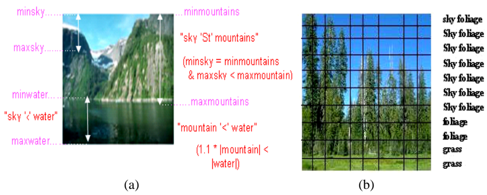
Fig. 1. QSR using (a) relative size and Allen's calculus (b) chord representation

on just one here where the relative size representation is recorded separately within 3 image areas: Top (T: top 3 rows), Middle (M: rows 4-7), Bottom (B: rows 8-10).