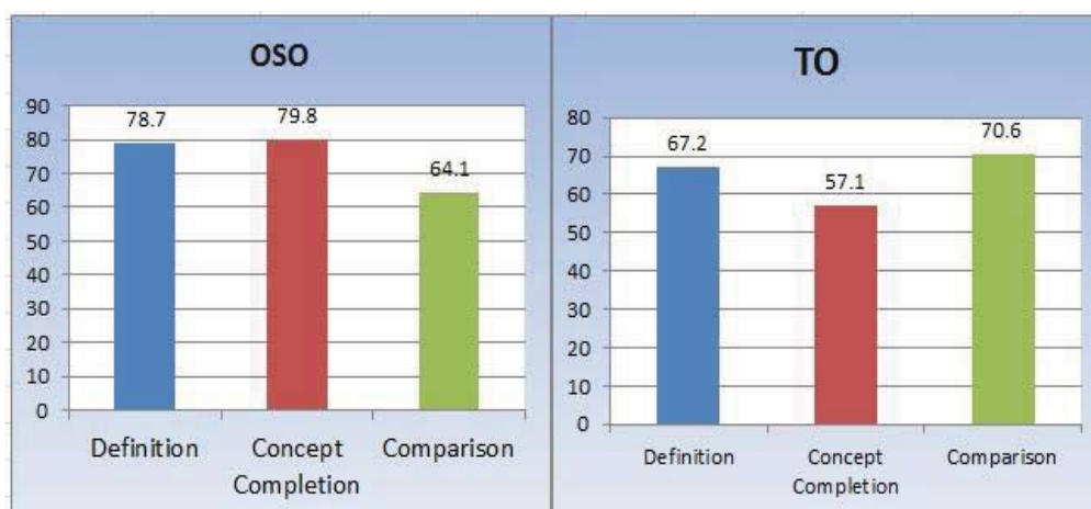
Figure 2: Percentages of correct question generated

Figure 2 shows the percentages of correct questions that can be generated from ontologies where OSO gives more promising results compared to TO. OSO shows a higher percentage of correct questions in the first two question categories, namely definition and concept completion, but a slightly lower percentage compare to TO in the third question category, comparison. The result from this experiment has shown that more than three quarters of incorrect questions generated from both ontologies are due to incorrect naming of concepts. We list all the reasons of incorrect naming and organize them into five categories in the following subsection.